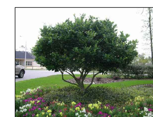
JAPANESE PRIVET TREE