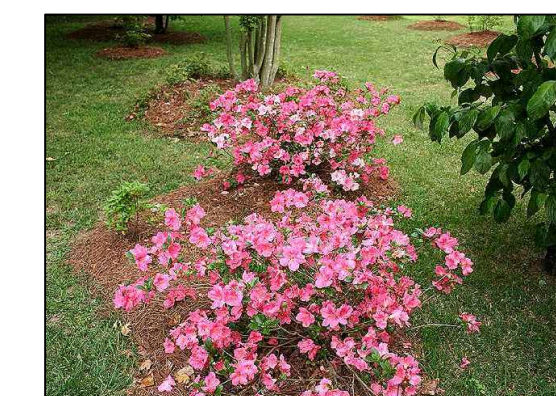
CONVERSATION PIECE AZALEA