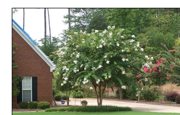
NATCHEZ CRAPE MYRTLE