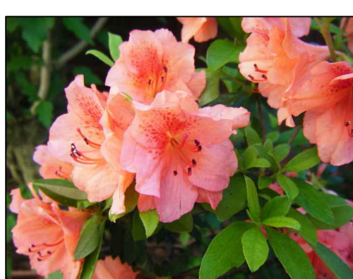
DUC DE ROHAN AZALEA