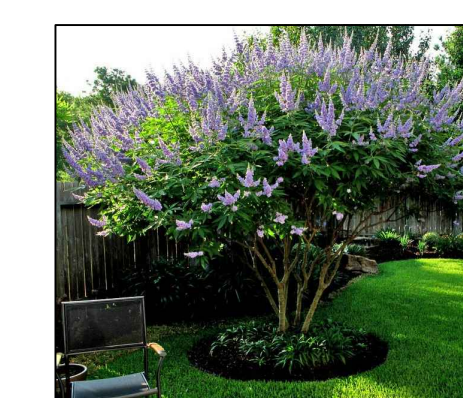
LILAC CHASTE TREE