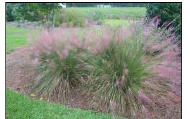
PINK MUHLY GRASS