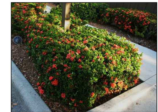
DWARF FLAME OF THE WOODS