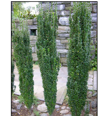
SKY PENCIL HOLLY